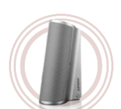
Lenovo 500 2.0 Bluetooth® Speaker