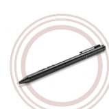
Lenovo Active Pen 2*